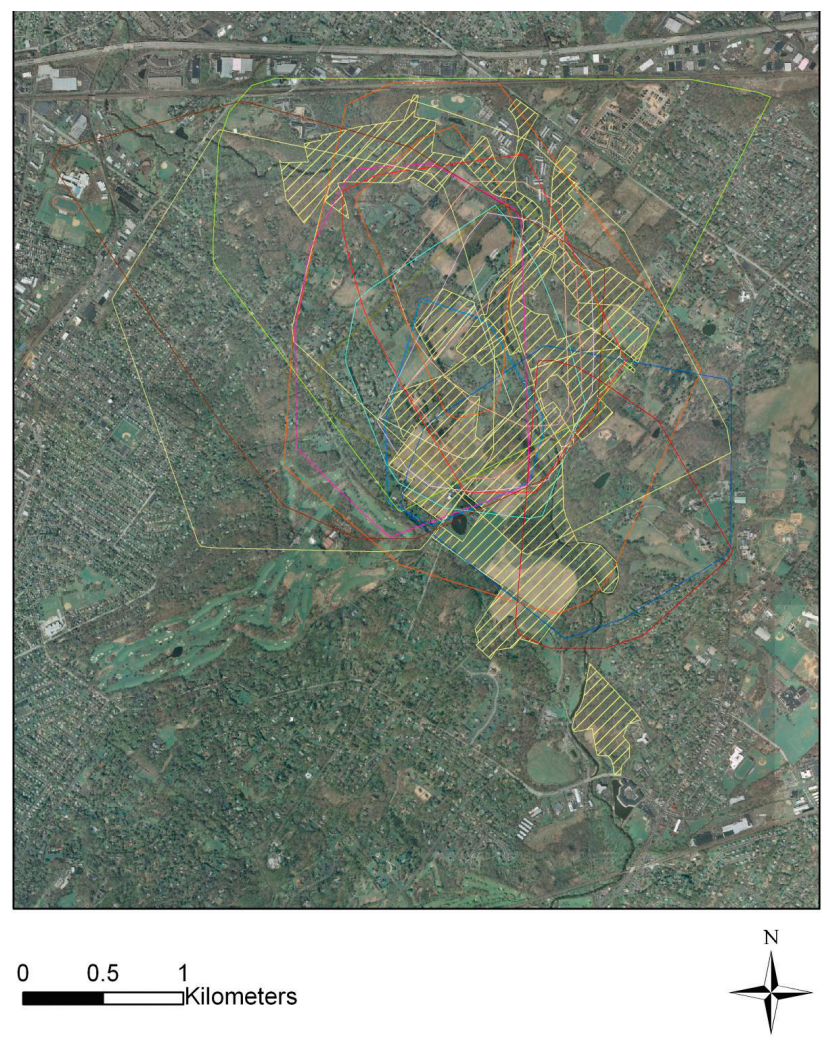
Figure 1. Pennypack Ecological Restoration Trust lands (yellow highlights), and surrounding habitat where deer movements were monitored. Home ranges of individual deer are outlined by different colors