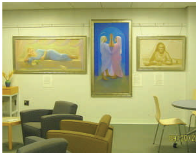
Left to right: Gabriel's Gift; The Visitation; The Prophecy; Elizabeth

Women of Grace opened with a reception on Sunday, September 26. The paintings will remain on display in the Library until mid-December.