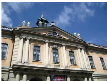
Royal Academy of Science, Stockholm